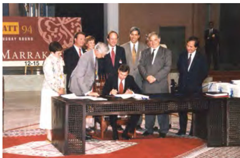
Signing in April 1994 of the Marrakesh Agreement, which formally established the WTO.

Since CITES predates the concepts of sustainable development and use as articulated in global environmental summits and international agreements, there is no express mention in the Convention of sustainable development. Nevertheless, the broad contributions of CITES to achieving sustainable development and use result directly from the text of the Convention and the way it is applied. Its requirements that trade not be detrimental to the survival of the species concerned, and that species be maintained throughout their range at a level consistent with their role in the ecosystem, contribute directly to achieving sustainable consumption and production – one of the key elements of sustainable development. The Convention's requirements that traded specimens be lawfully obtained and that Parties take appropriate measures to enforce the Convention also contribute to these objectives, as do efforts under the Convention to combat illegal trade in wildlife.