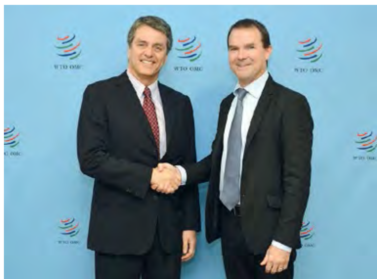
WTO Director-General Robert Azevêdo and CITES Secretary-General John E. Scanlon (right).