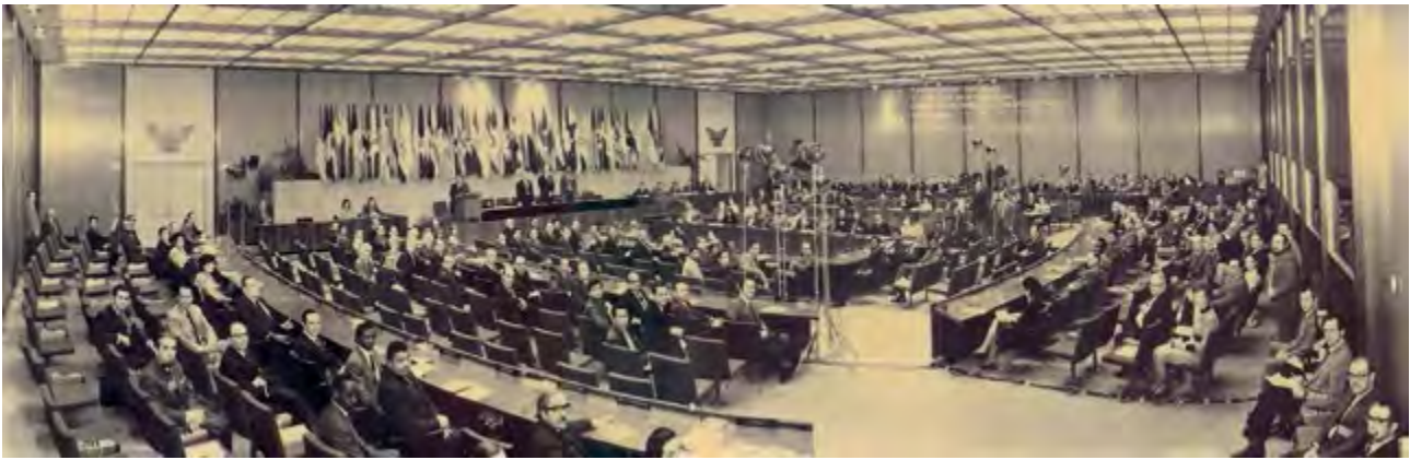
CITES Plenipotentiary Conference, Washington, D.C., 3 March 1973

may be affected by activities carried out in another. In its Preamble, CITES recognizes that peoples and states are – and should be – the best protectors of their own wild fauna and flora. At the same time, it recognizes in another part of the Preamble that international cooperation is essential for the protection of certain wildlife species against over-exploitation through international trade. The Convention may therefore be seen as recognition of the need for a global approach to the regulation of international wildlife trade that favours multilateral cooperation and concerted action, while also preserving the right of states to adopt stricter domestic measures.