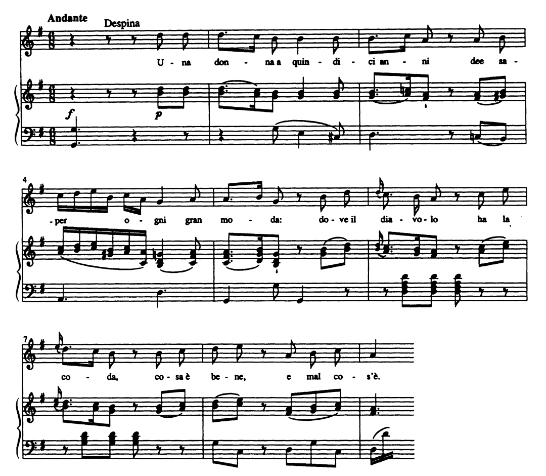
Ex. 2. 'Una donna a quindici anni'. Translation: A woman of fifteen years must know all the ways of the world: where the devil has his tail, what is good and what is bad.