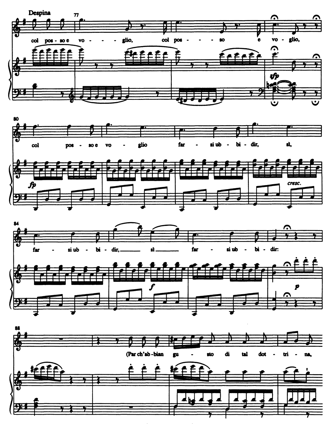
Ex. 5. 'Una donna a quindici anni'.

line that reaches all the way to b''. This kind of cadential material is adequate to close off any aria sung by a heroic character; all that might be lacking is a ritornello to escort Despina offstage. What follows at bar 87, however, is an instrumental fragment of the opening melody, followed by its return not to the original text, but,