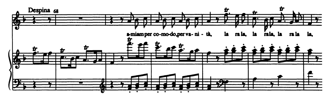
Ex. 7. 'In uomini, in soldati'. Translation: Let's love them out of convenience, out of vanity.

syllables and the gestures towards dance in the orchestral interludes furnishing two of the strongest emblems of the pastoral: the lyric and the choreographic (see Ex. 7).<sup>39</sup> Despina's turn to these devices typifies the balance of the naive and sophisticated she strikes through much of the opera: she is naive because the topics by themselves paint a playful character lacking the gloomy reflection that so often oppresses the amanti ; sophisticated because she is – just as in the second-act aria – aware both of the role she is playing and the means she uses to express herself. For Despina, the pastoral is not superficial; unlike the masks of the Doctor and Notary she puts on and removes at will, her pastoral mask is inextricably bound up with her personality.