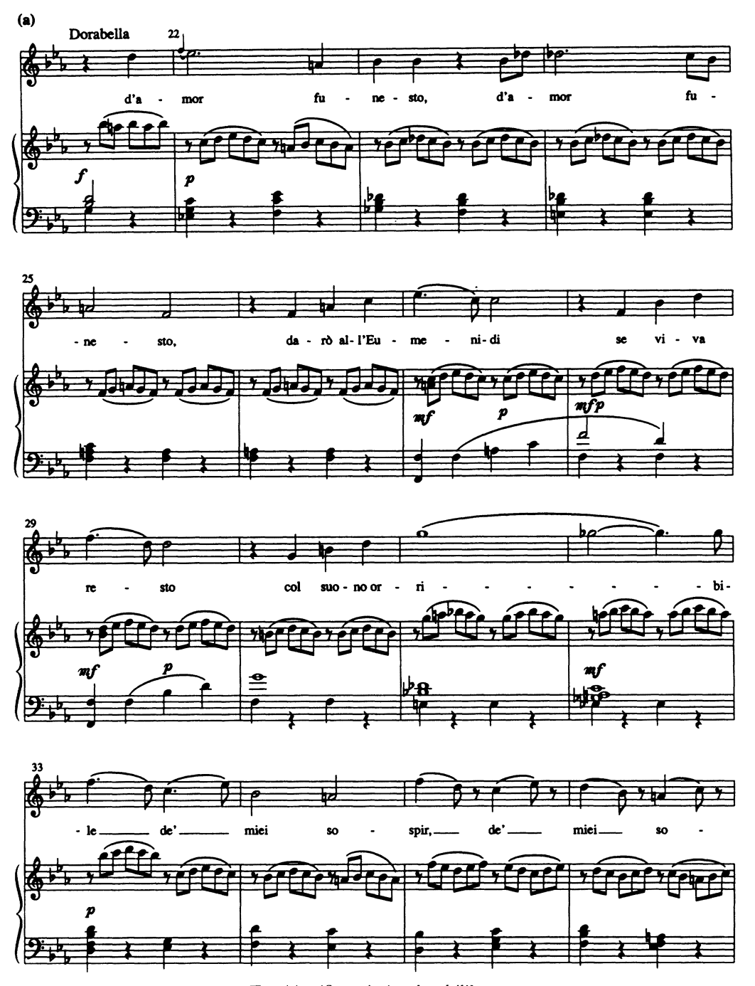
Ex. 11a. 'Smanie implacabili'.

B flat, the new tonic, for more than a dozen bars (see Ex. 11a). Resolution comes only after a sequential passage reaches its peak on g'' and then descends chromatically to f''. That this chromatic figure occurs on the word 'orribile' shows