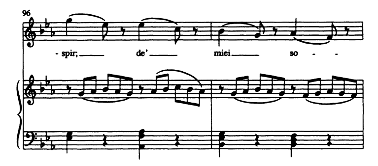
Ex. 12. 'Smanie implacabili'.

basic level of the phrase, just as in poetry one finds heroic types of scansion.<sup>46</sup> In his article 'Rhythmus' for Sulzer's Allgemeine Theorie der schönen Künste , for