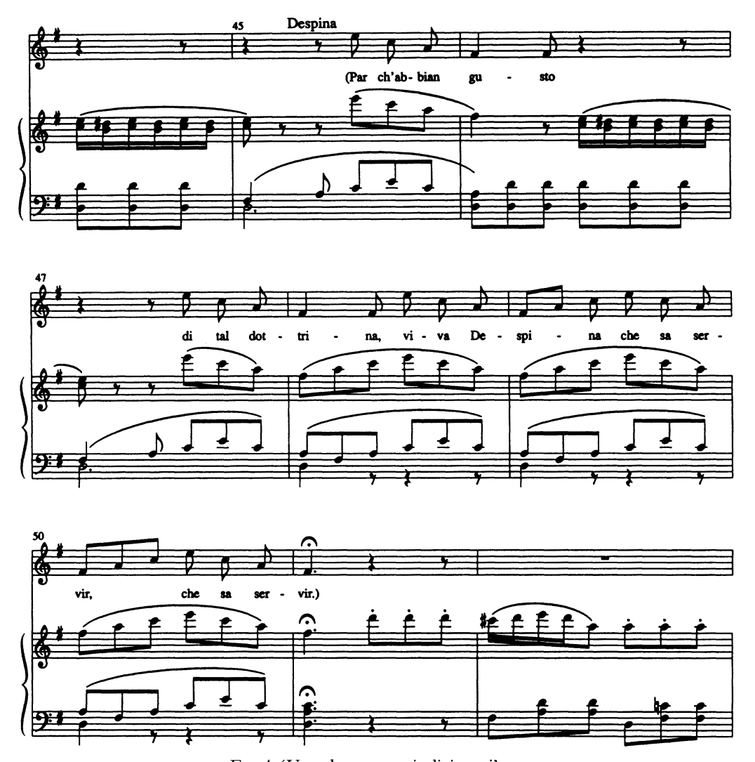
Ex. 4. 'Una donna a quindici anni'.

soglio, posso, voglio) providing the verses with more declamatory flexibility through their suggestion of internal rhyme.<sup>34</sup> Clearly, this passage is the chief point of Despina's exhortation.