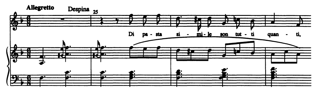
Ex. 6. 'In uomini, in soldati'. Translation: They are all made of the same stuff.