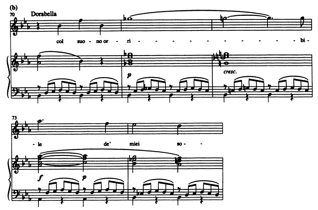
Ex. 11b. 'Smanie implacabili'.

a nice conjunction between local detail and long-range shape: on the one hand, the chromaticism makes for a poignant setting of the phrase 'col suono orribile'; on the other, it impels a weighty expansion of this section of the aria. Much the same occurs in the recapitulation, though the melody is recast to keep it in a manageable vocal range and to uphold the prominence of the g''-g^{b''}-f'' melodic progression (see Ex. 11b).