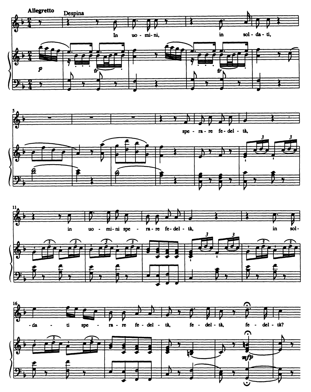
Ex. 1. 'In uomini, in soldati'. Translation: In men, in soldiers, you hope to find fidelity?

dramatic weight equal to that of an accompanied recitative. At the same time, its unconventional style signals a tone and function different from the typical accompanied recitative/aria scheme that the lovers in this 'scuola degli amanti'