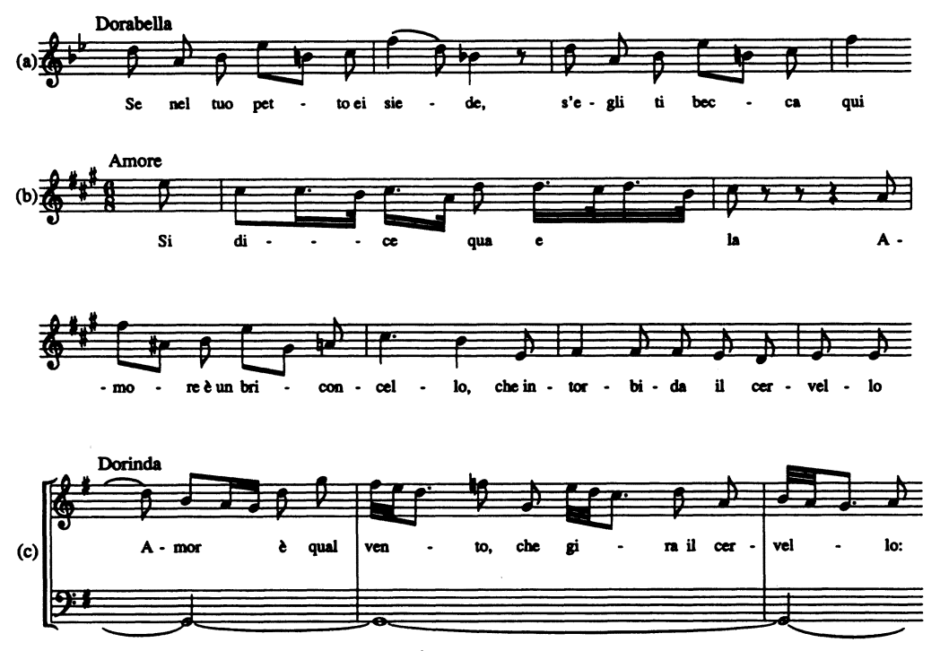
Ex. 14. Cupid and pastoral settings. (a) 'È amore un ladroncello'. Translation: If he settles in your heart, if he nips you there. (b) 'Si dice qua', from L'arbore di Diana . (c) Handel, Orlando.

begins in a café, it is only because the opera is creating a contrast between the urban and the rustic, the familiar and the Other, which is a main impulse behind pastoral literature. The trio 'Soave sia il vento' also has especially strong pastoral qualities. The poem is lyric in its suppression of active verbs (only 'risponda' is in the active voice, and even it maintains the idea of a wish for something that is past), elegiac in its gestures of farewell, the ship voyage in particular furnishing an ancient emblem of departure:<sup>52</sup>