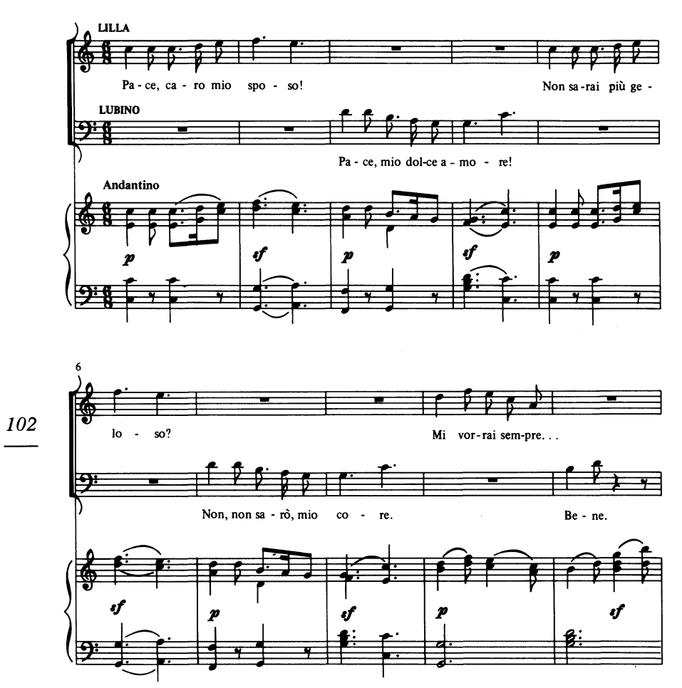
EXAMPLE 3. Duet, Act II No. 15, mm. 1-24.